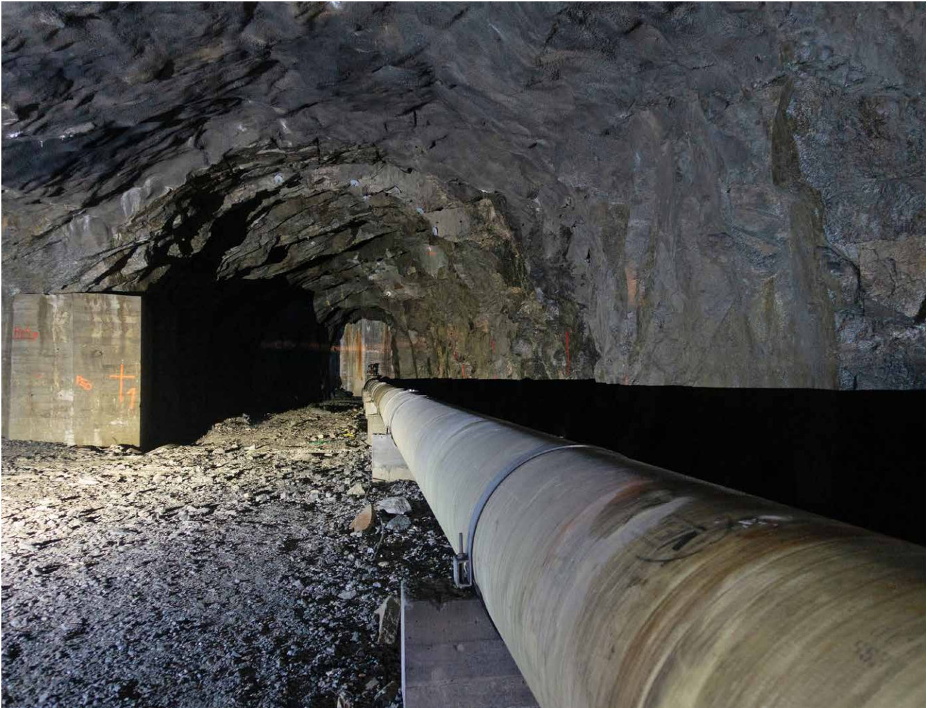
Fig. 1: GRP pipeline for a hydropower in Jøsenfjorden, Norway shows excellent condition after 40 years of operation

In the early 1980s, Amiblu (then Vera) installed a GRP pipeline for a hydropower facility operated by Statkraft in Jøsenfjorden, Norway. Four decades later, a detailed ultrasonic inspection confirmed what long-term performance had already suggested: despite demanding service environments, the pipeline is still in excellent condition. A quality that is backed by decades of research and product development by Amiblu.